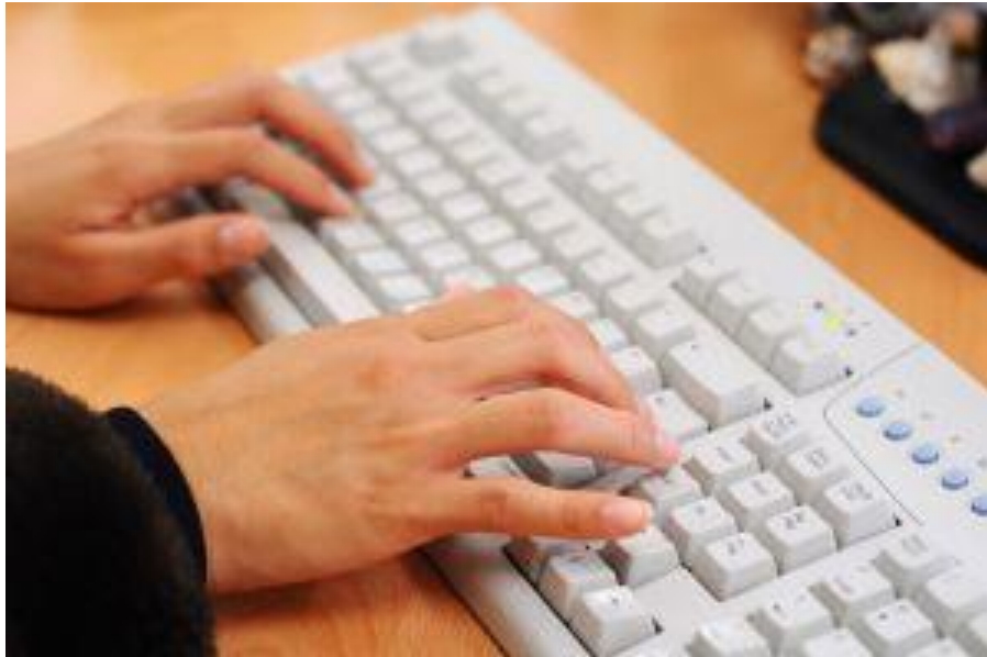
The Description 1

Using images will definitely contribute positively to the traffic movement towards a particular site. Therefore it would be prudent to have some knowledge on how this works and its positive contributing factors that facilitate the ideal traffic flow.